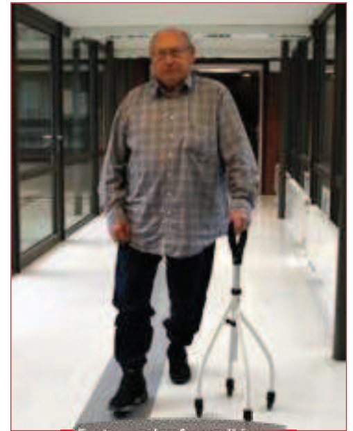
Faster and safer walking

Wheeleo, the rolling cane, is designed to offer a solution to these 3 challenges and offers additional benefits: • Ease of handling, no special training required; • Walking goes a lot faster than with a quadripod cane; • Safer walking than with a quadripod cane, as there is constant ground contact; • One-handed use while still maintaining constant ground contact, the other hand can be used to move an object, to open doors, ... • Minimal space required and perfect for indoor use where a rollator is too big. • Reinforced stability: the wheels offer a security system. A lateral push will result in a lateral movement, not a tilting/fall.